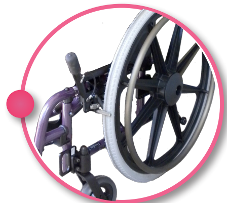
Hub Lock Feature

2241 N. Madera Rd. Simi Valley, CA 93065 Phone: 800-331-8551 • Fax: 888-582-1509 Email: CustomerService@freedomdesigns.com